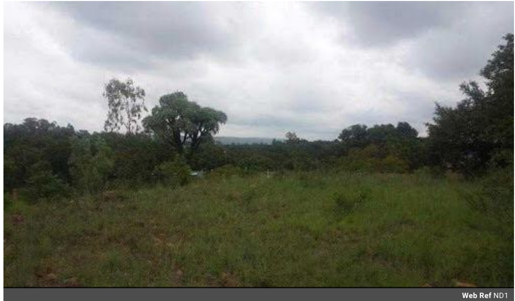
Web Ref ND1

Unit 203 First Floor, Lynwood Lane Retail Centre Lynnwood Road Equestria Pretoria 0050