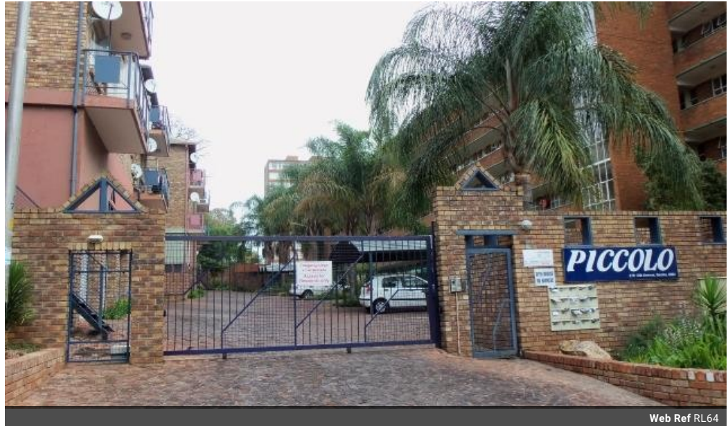
Web Ref RL64

Unit 203 First Floor, Lynnwood Lane Retail Centre Lynnwood Road Equestria Pretoria 0050