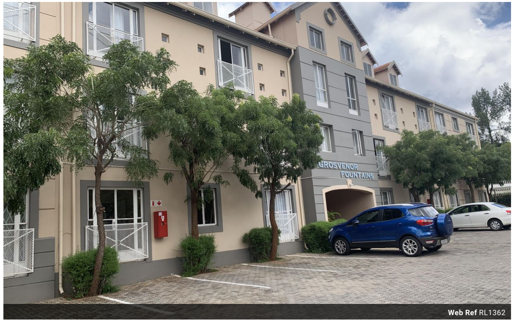
Web Ref RL1362

Unit 203 First Floor, Lynwood Lane Retail Centre Lynwood Road Equestria Pretoria 0050