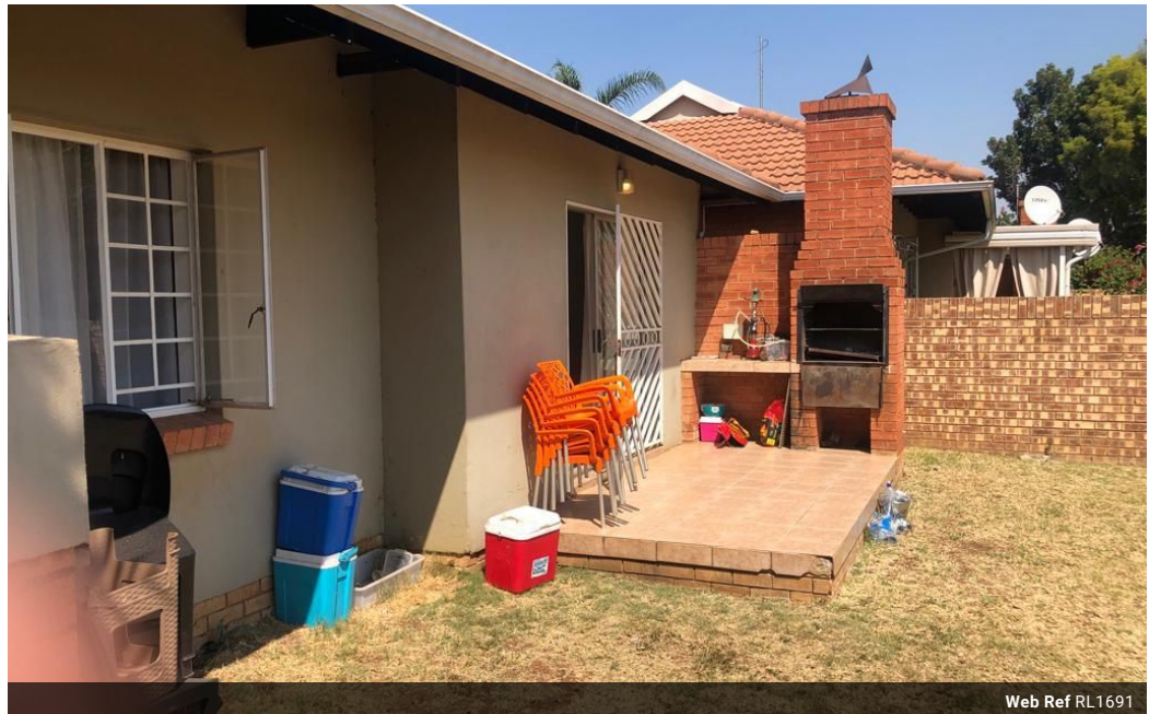
Web Ref RL1691

Unit 203 First Floor, Lynwood Lane Retail Centre Lynnwood Road Equestria Pretoria 0050