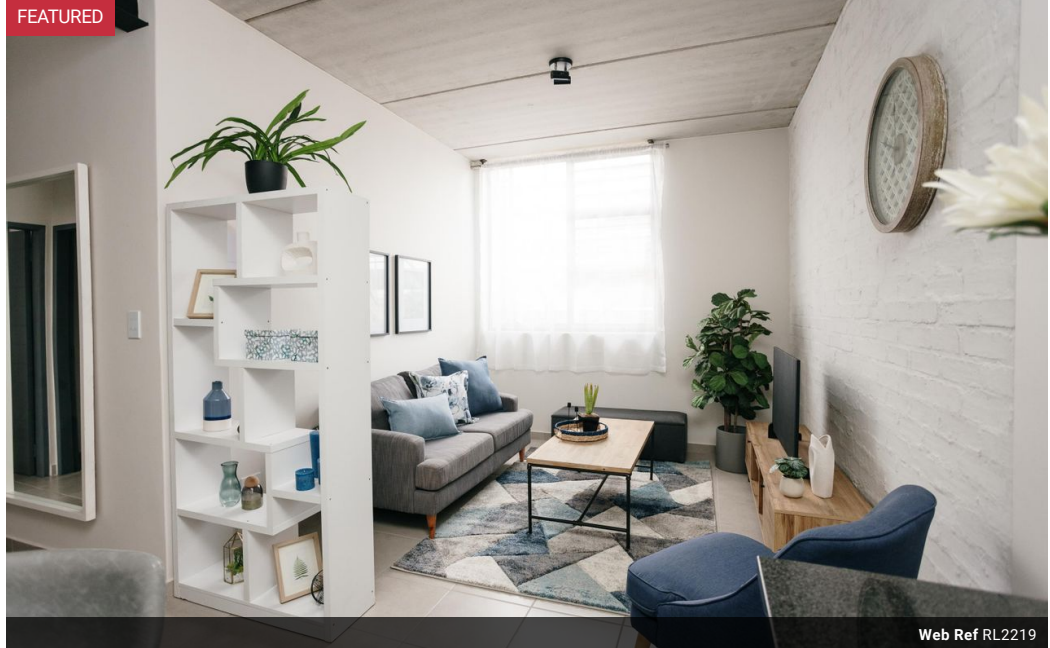
Web Ref RL2219

Unit 203 First Floor, Lynwood Lane Retail Centre Lynnwood Road Equestria Pretoria 0050