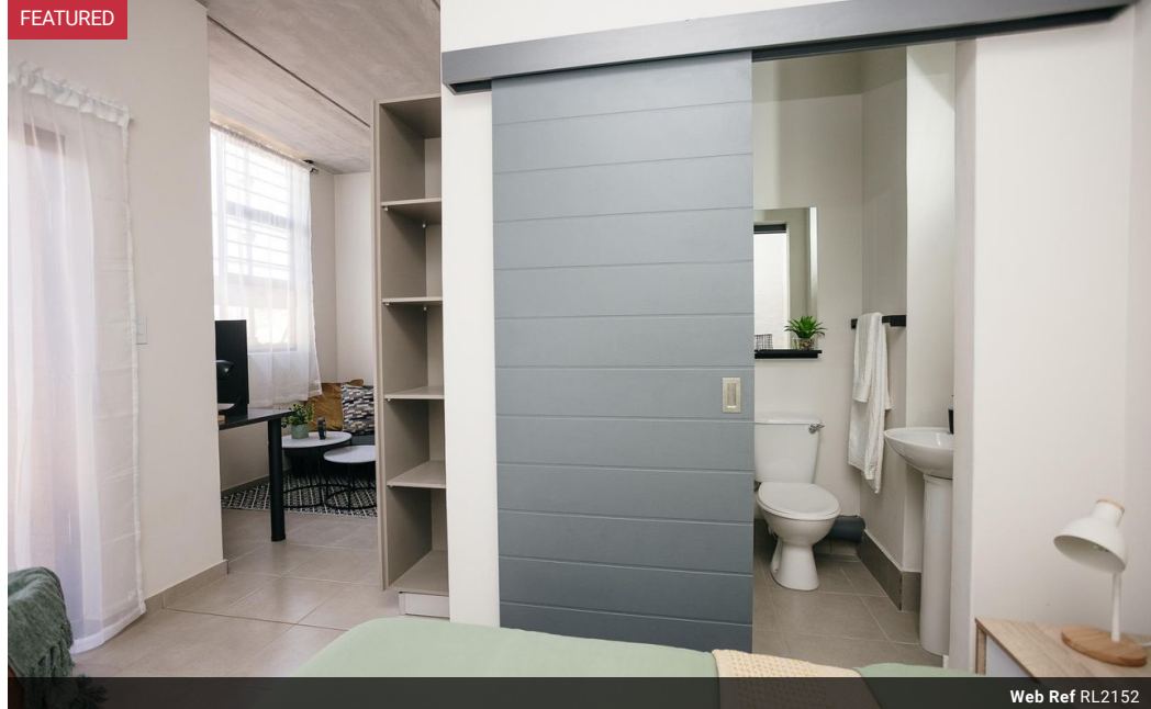
Web Ref RL2152

Unit 203 First Floor, Lynnwood Lane Retail Centre Lynnwood Road Equestria Pretoria 0050