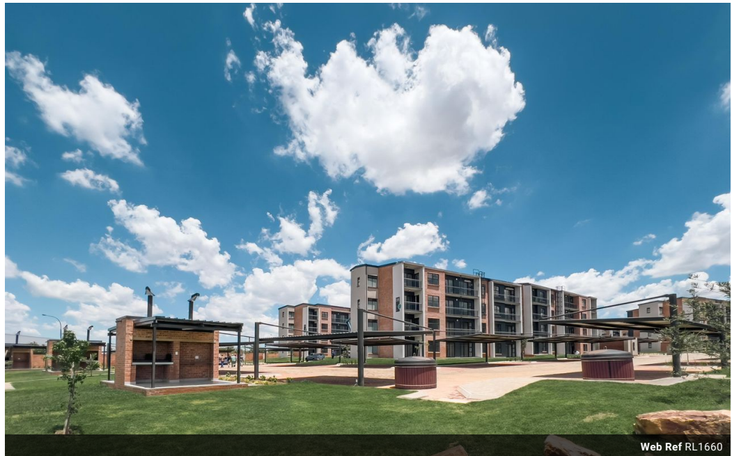
Web Ref RL1660

Unit 203 First Floor, Lynnwood Lane Retail Centre Lynnwood Road Equestria Pretoria 0050