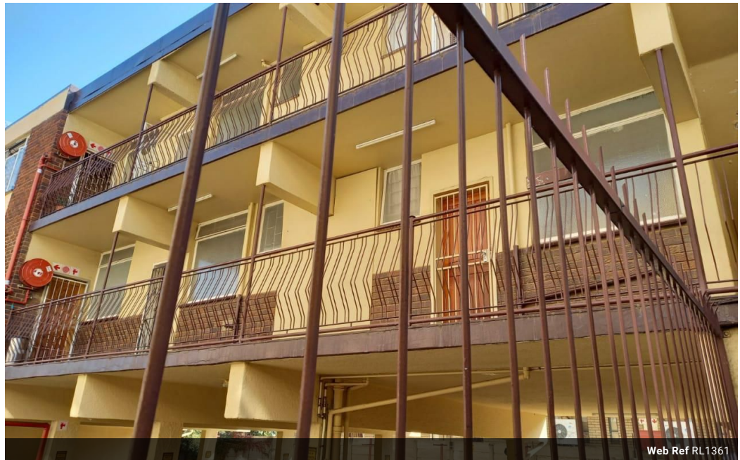
Web Ref RL1361

Unit 203 First Floor, Lynwood Lane Retail Centre Lynnwood Road Equestria Pretoria 0050